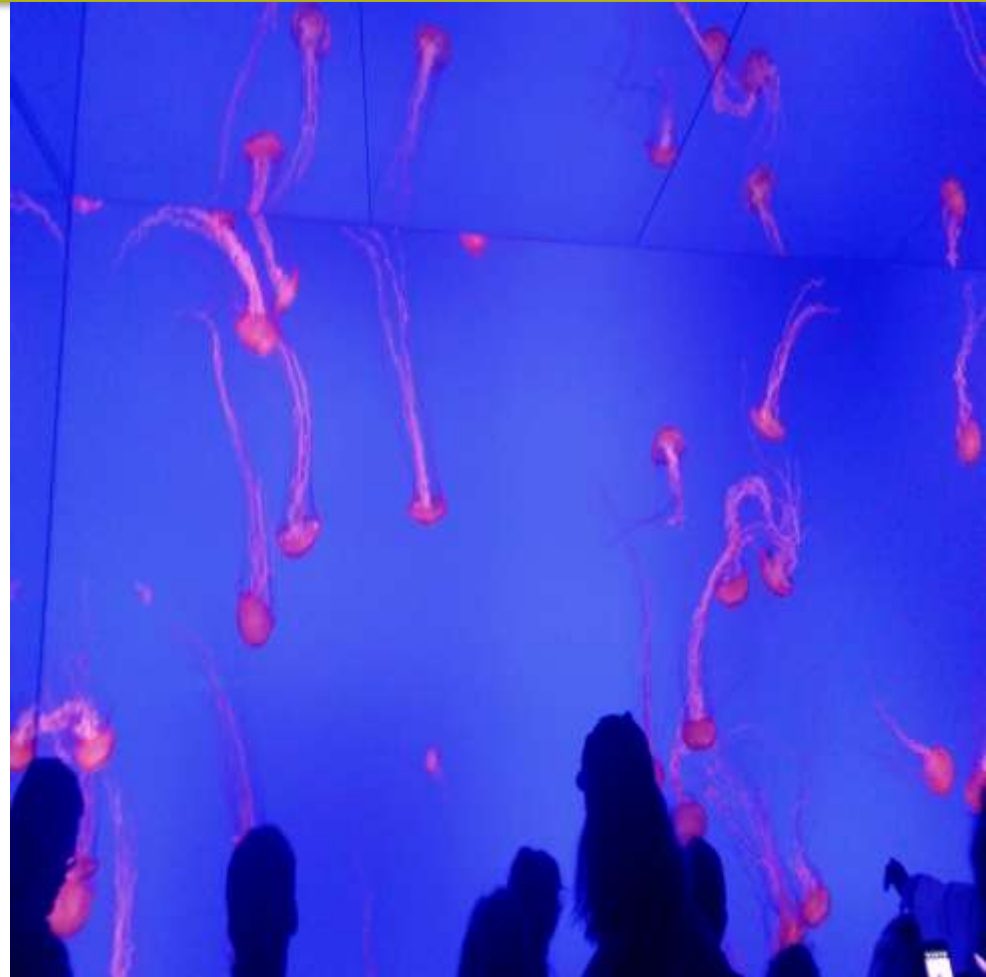
Sea anemone and Jelly fishes at aquarium in Toronto, Canada.