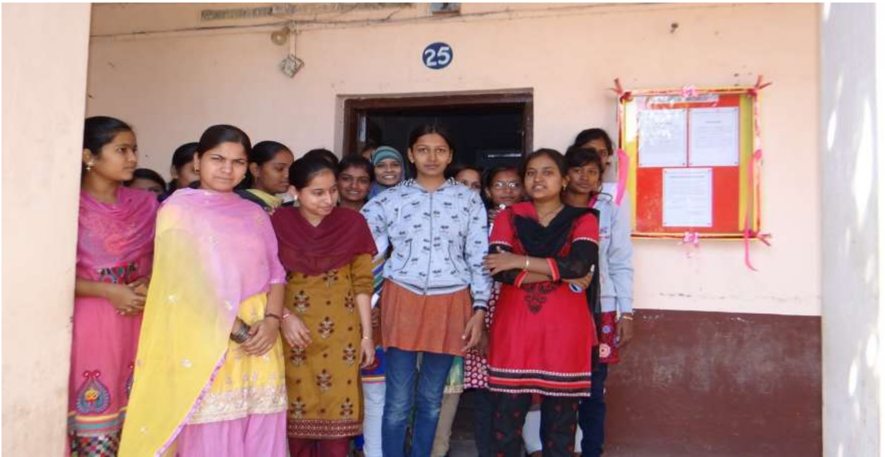
Participation of Students