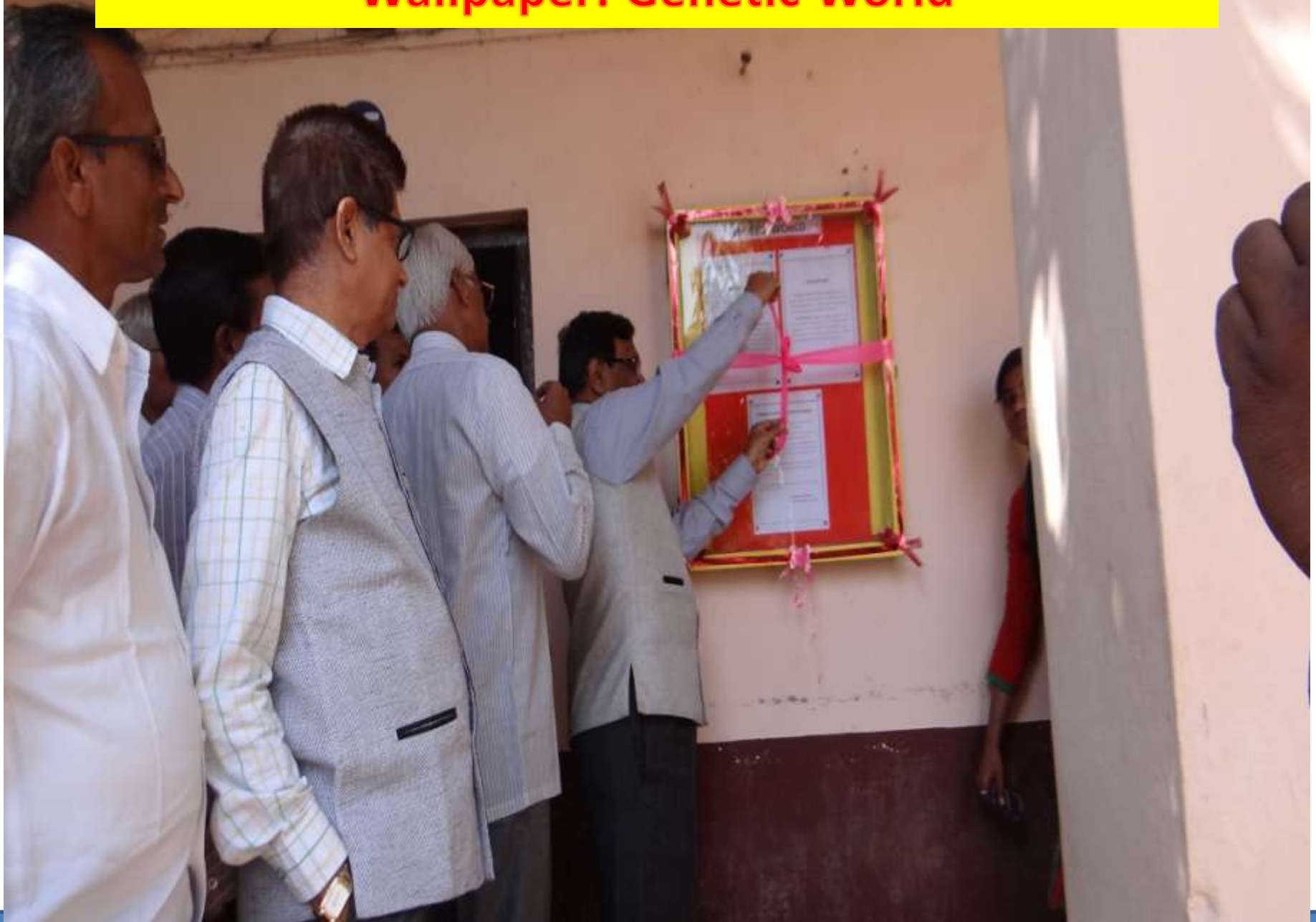
Inauguration of Wallpaper by Principal