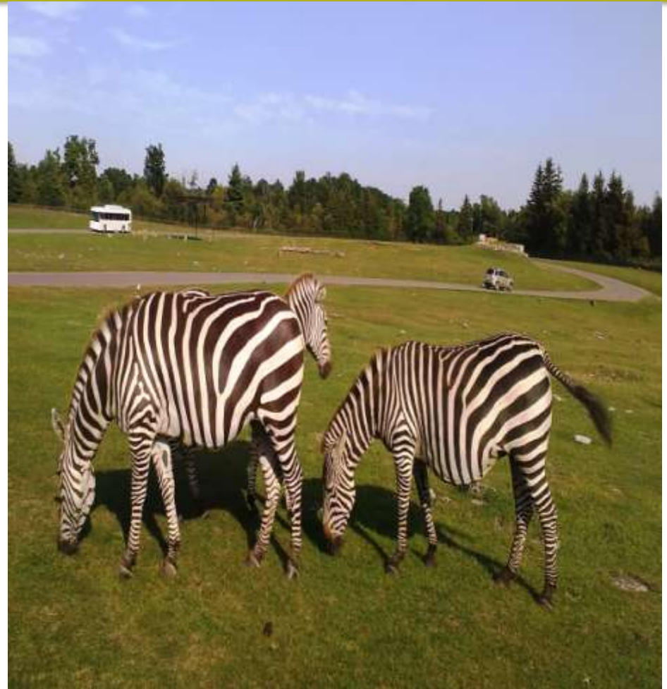
White lion and Zebra during African Safari in Gulf, Canada.