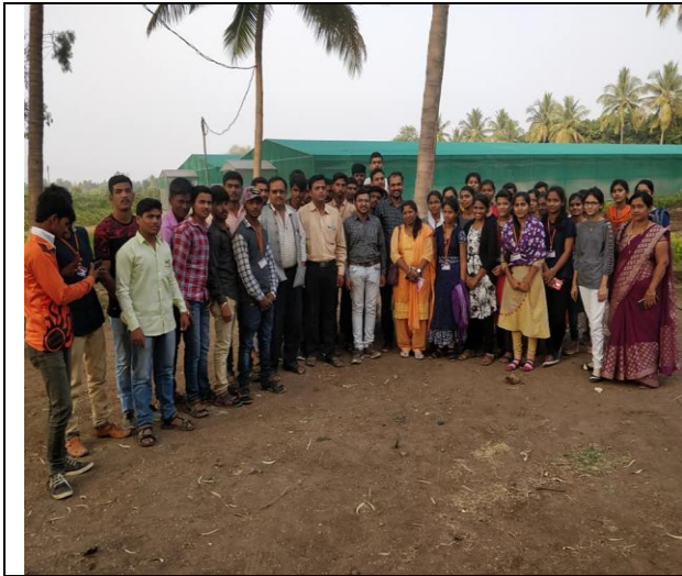
MPKV Rahuri Fruit and Vegetable Nursery Visit