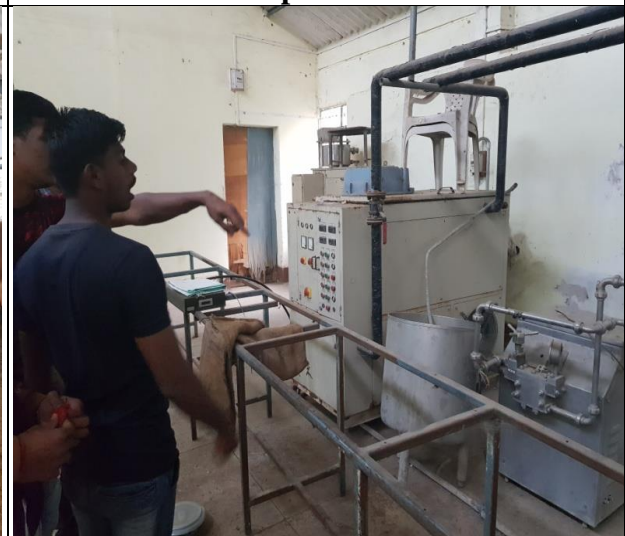
Milk Processing Center MPKV Rahuri