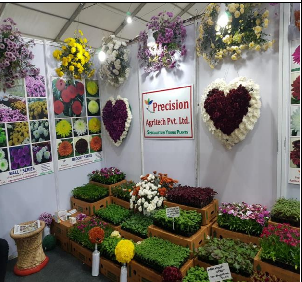
KISAN Exhibition Ornamental plant Stall