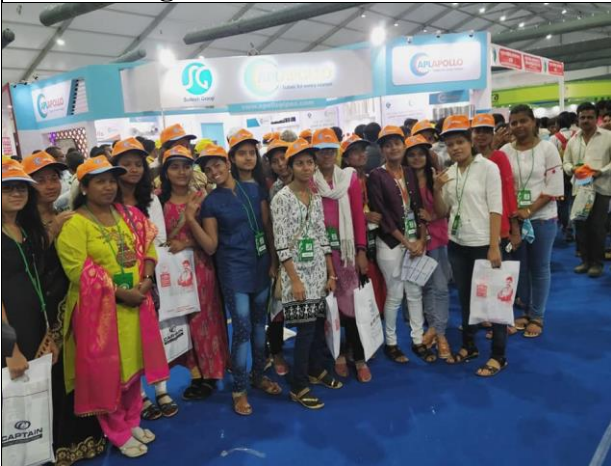
Students at KISAN Exhibition Stall