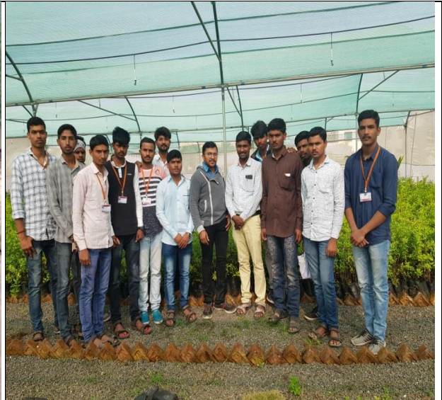
Babhleshwar KVK Guava Nursery Hardening Plant of Sardar Variety