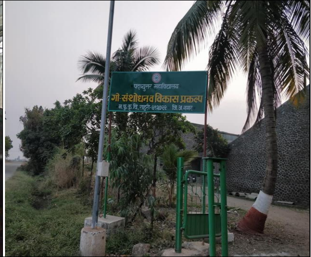
MPKV Rahuri Phule Triveni Cow Breed Center Visit