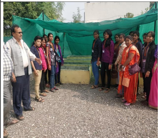
Spirulina Production Center at KVK Babbleshwar