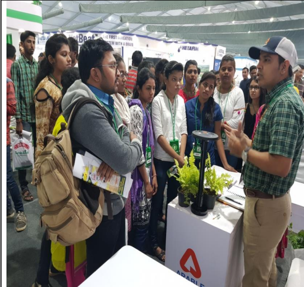
Students are taking information of plant automatic weather and diseases forecasting machine at KISAN Exhibition