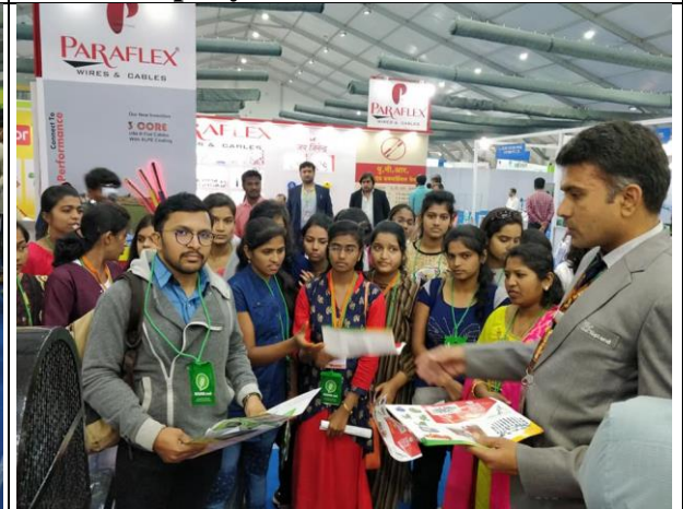
Students are taking information of Tractor operated multipurpose generator at KISAN Exhibition Stall