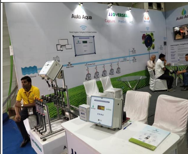
Fertigation unit at KISAN Exhibition