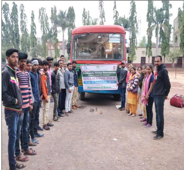
Journey Start for Educational Tour