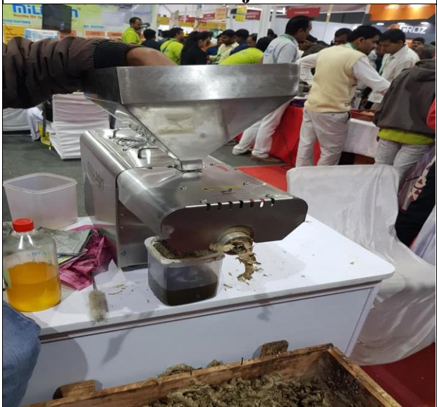
KISAN Exhibition Mini Oil Mill