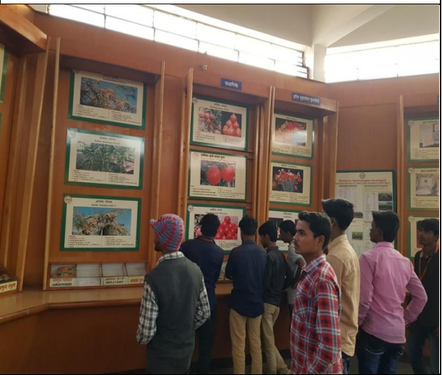
MPKV Rahuri Information Center