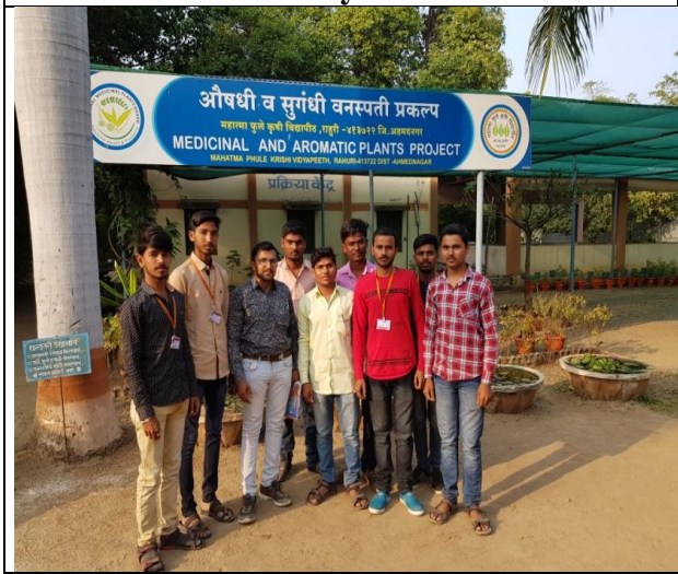
MPKV Rahuri Medicinal and Aromatic Plant Projects