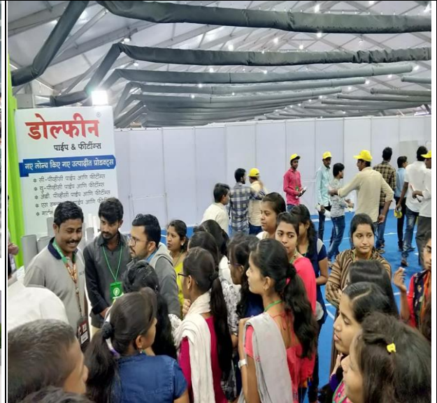
Students are taking information of plant drip irrigation technology of Dolphin company at KISAN Exhibition