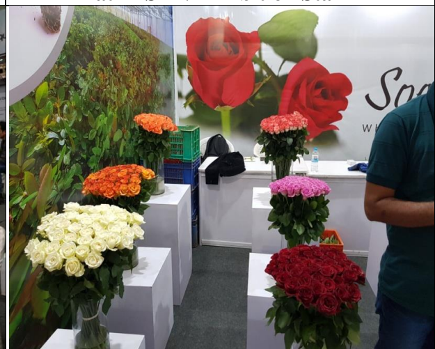
Dutch Rose Variety at KISAN Exhibition