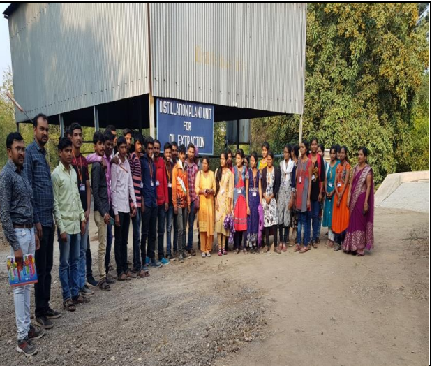
MPKV Rahuri Oil Extraction Distillery