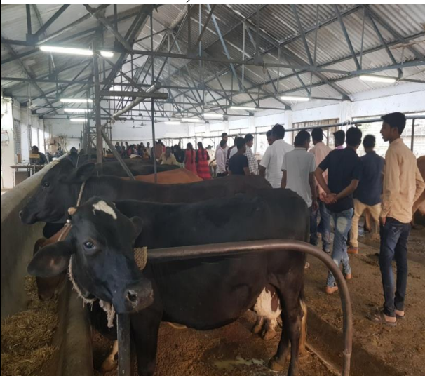
MPKV Rahuri Phule Triveni Cow Breed