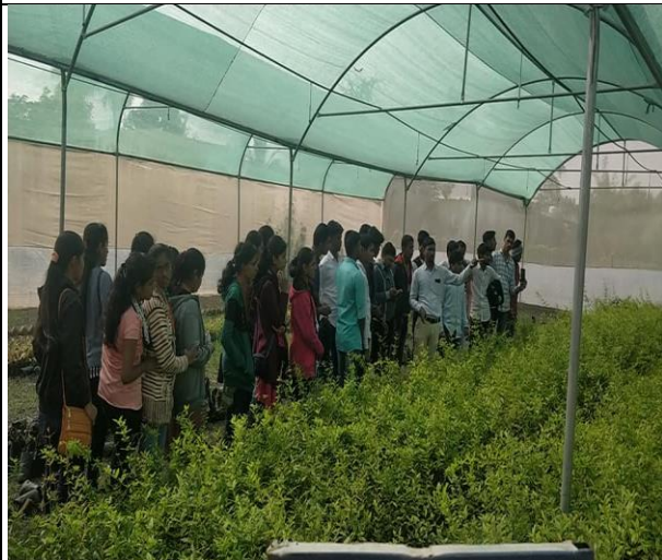
Seedless Citrus Variety Hardening Center at KVK, Babhleshwar